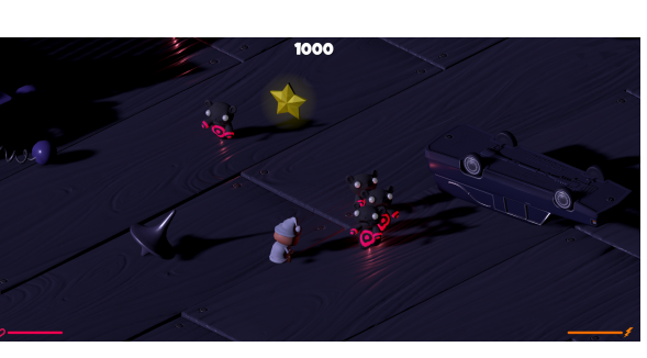
(b) Freud me out 2 gameplay